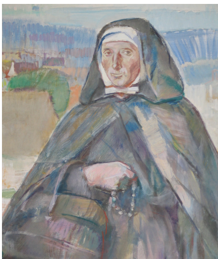
St. Jeanne Jugan with her begging basket.