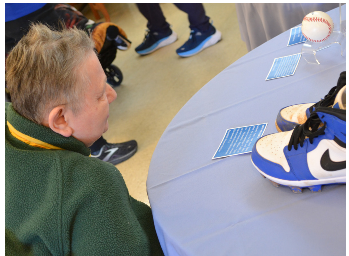
CeCe takes a close-up look.