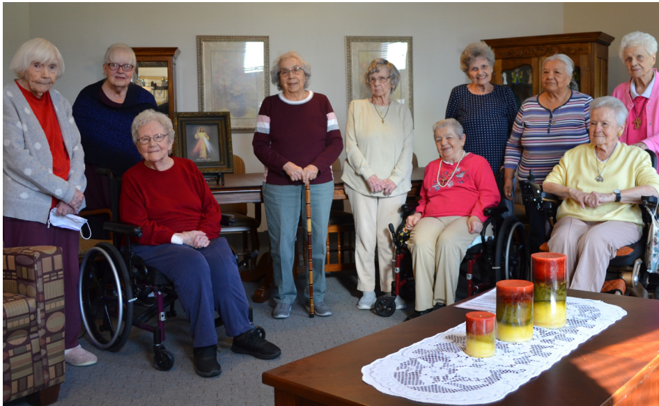
The Divine Mercy Family Prayer Group